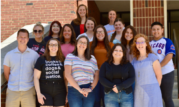
Master's teacher scholars in the new English Education program

The Department of English launched an exciting new online master's degree program for practicing English Language Arts (ELA) teachers. This is a first of a kind degree program in the state of Illinois that addresses the ongoing need to support teachers who seek learning about how to improve the effectiveness of their socially just, equitable English instruction in their secondary (middle and high school) classrooms in urban, rural, and suburban communities. Due to a growing need not only in Illinois but throughout the country, the program's focus is on inclusive, equitable English instruction that responds to teachers' desire for advanced graduate study that helps them navigate the challenges and opportunities available as they work within systems of inequity while seeking to celebrate and foster the genius of their diverse students.